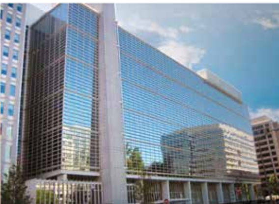
The World Bank . Kohn Pedersen Fox Associates