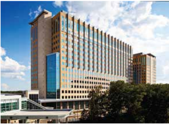
BRAC 133 at Mark Center . HKS