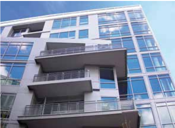
WestEnd25 . Shalom Baranes Associates