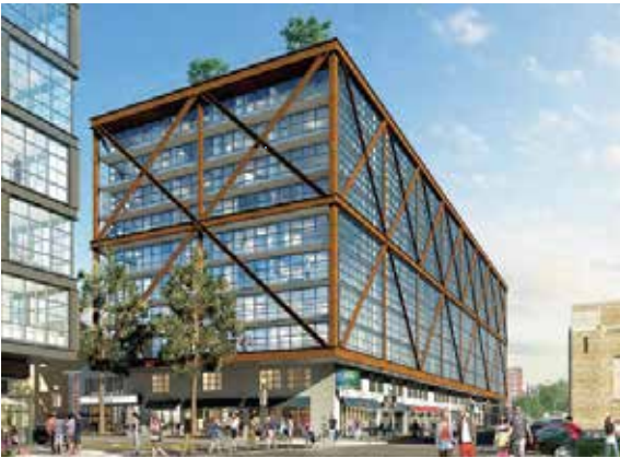
Atlantic Plumbing . Morris Adjmi Architects