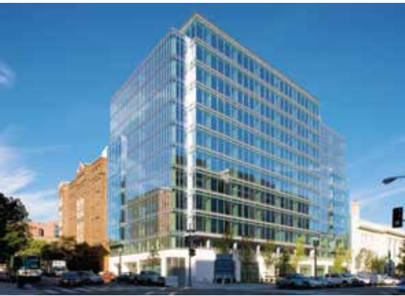
901 K Street . SmithGroup JJR