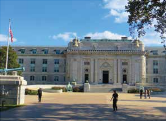
US Naval Academy-Bancroft Hall . Ernest Flagg