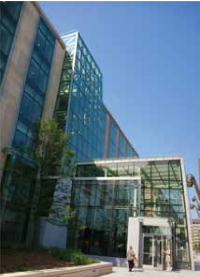
O'Neill Federal Building . Boggs & Partners Architects