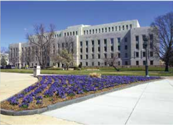
John Adams Building - Library of Congress . Architect of the Capitol