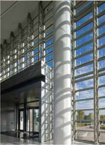
Sheppard Hall at Joint Base Andrews