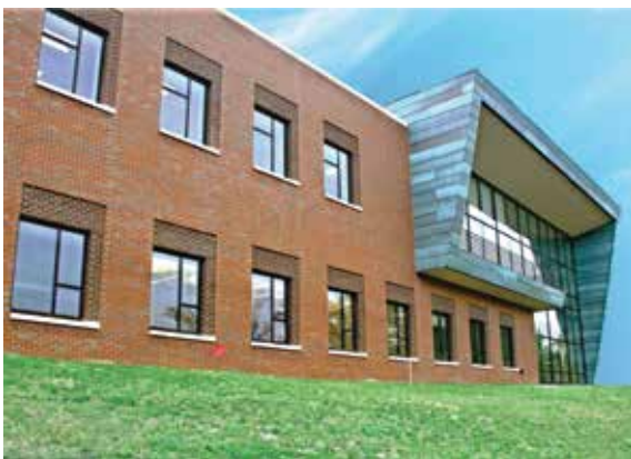
St. Elizabeths Hospital.