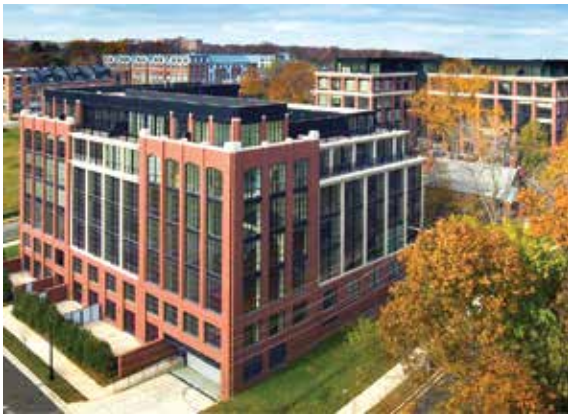
Wooster and Mercer Lofts . Cunningham Quill Architects