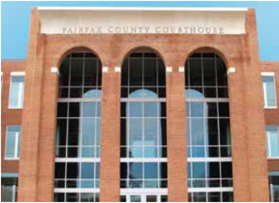
Fairfax County Courthouse . HDR