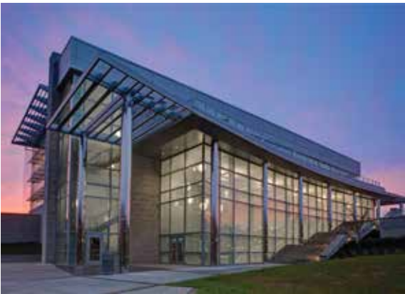
Engineering and Math Building at Cecil College

▶ Engineering and Math Building at Cecil College