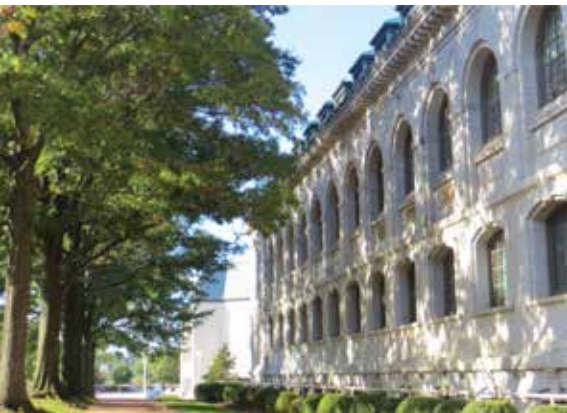
US Naval Academy-Maury Hall . Ernest Flagg