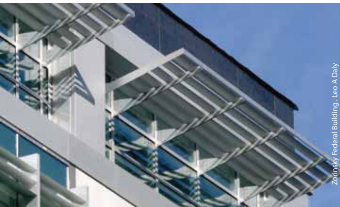
Zorinsky Federal Building - Leo A Daly