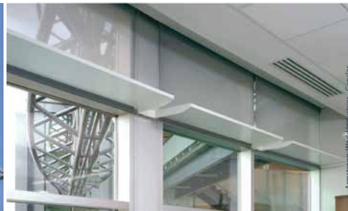
Armstrong World Industries - Gensler