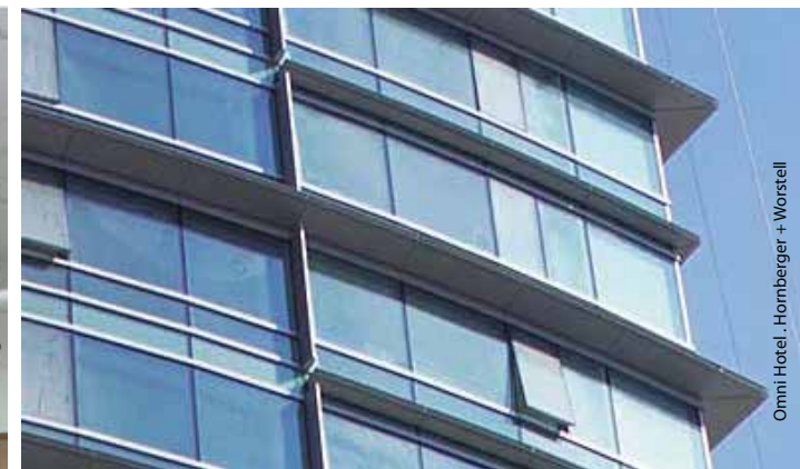
Omni Hotel - Hornberger + Worstell